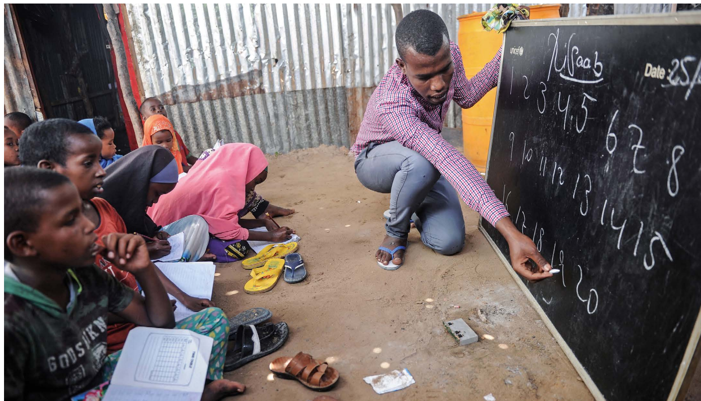
A young volunteer teaches children in a makeshift school at a camp near Mogadishu, Somalia, for people displaced by famine.

and purpose – which can, in turn, promote better mental health, especially for youth from marginalized groups 13 .